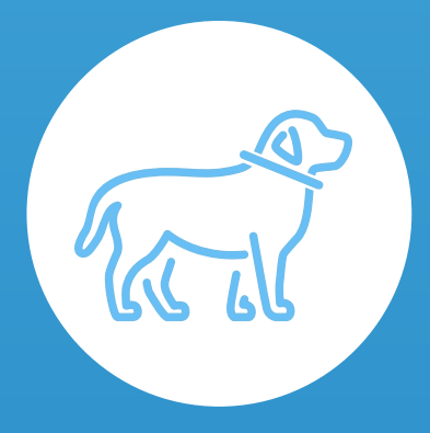
Dispose of pet waste in the trash.